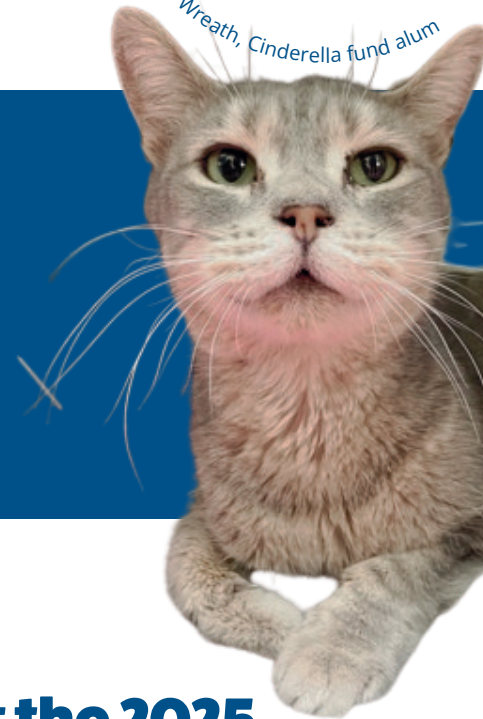
Wreath, Cinderella fund alum

of the 4,383 pets we cared for in 2025 required medical care beyond basic preventative care and spaying and neutering.