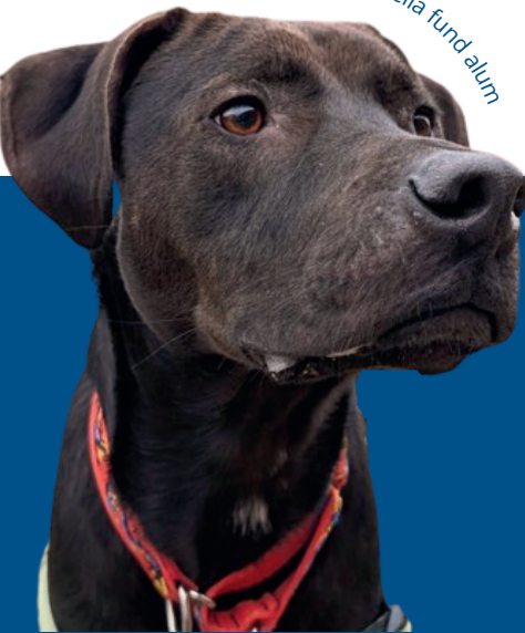
Goose, Cinderella fund alum

Net proceeds raised at the 2025 Fur Ball for the Cinderella Fund